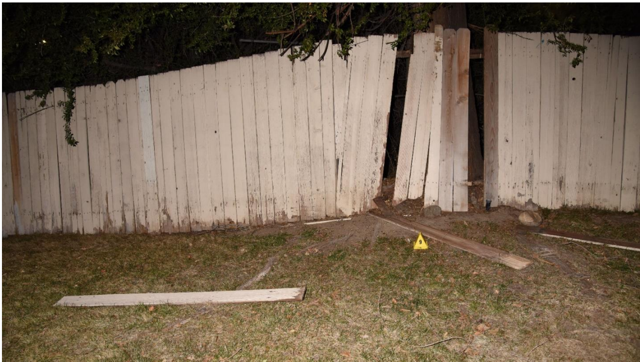
Wooden fence and placard 9 depicting the fence boards that were torn from the fence by Murillo.