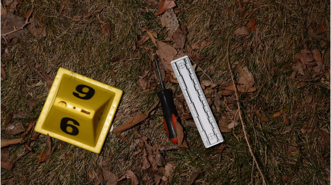
Black and red handled screwdriver at placard 6.

A flathead screwdriver with a red/black handle was found within the shooting scene.