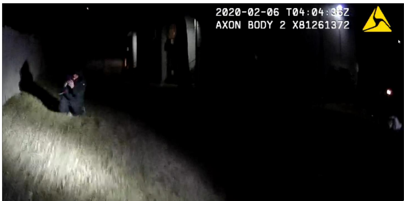
Video still: Screwdriver with red and black handle falling from Muriillo's grasp.