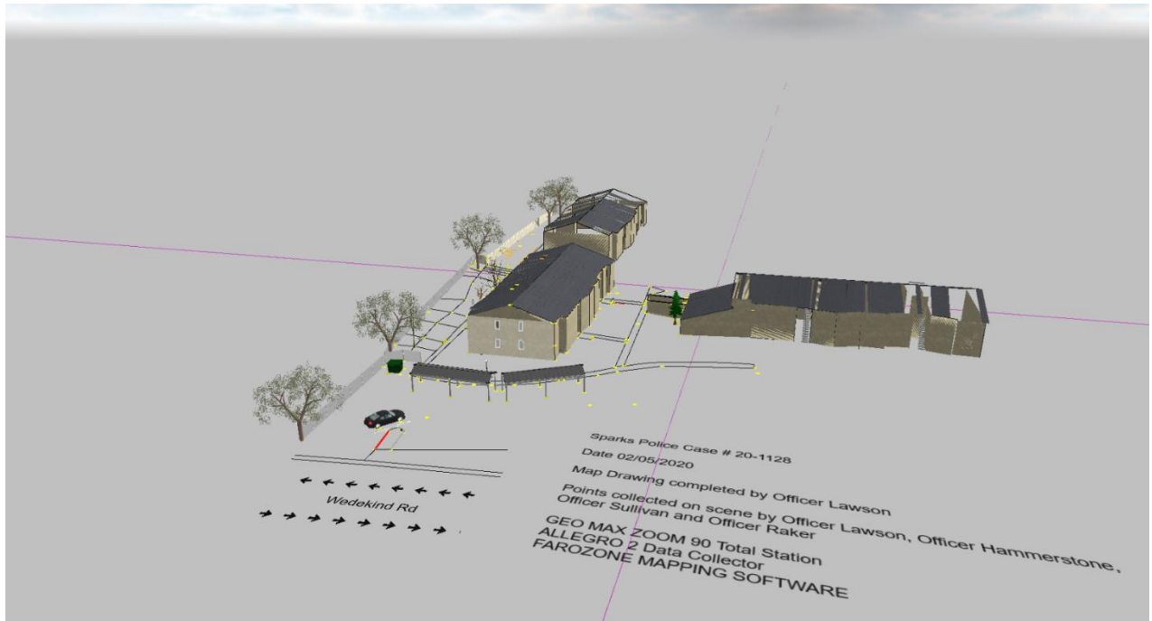
Diagram: Scene diagram prepared by SPD Officer Lawson of MAIT. The patrol car is located in the southwest parking lot, and the shooting occurred to the north, along the wooden fence line.