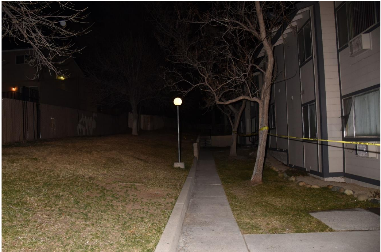
Grassy area along the west side of El Chaparral Apartments, looking north between the fence line and Buildings A through D where the shooting occurred. Evidence placards can be seen in the distance.